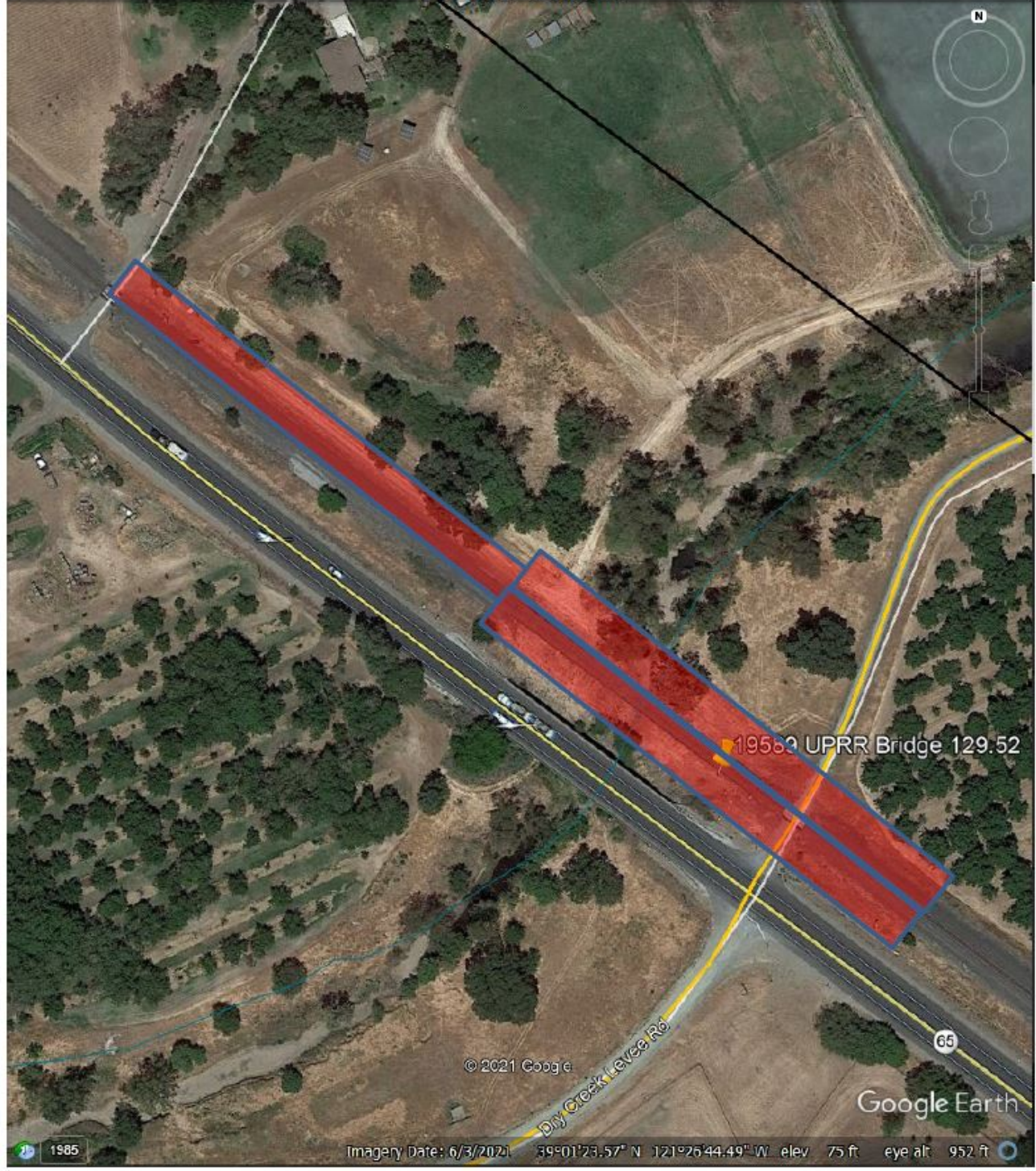
3) Approximate project footprint map